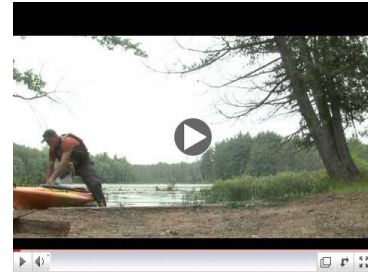
Big Island Wilderness

Located in the Hiawatha National Forest in Michigan's Upper Peninsula Big Island Lake Wilderness contains 23 small lakes ranging in size from 5 to 149 acres and the only way to reach each one is to portage in.