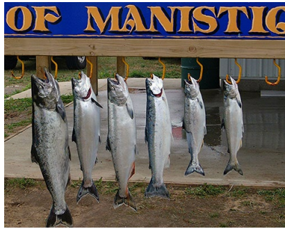
Manistique Trout and Salmon Derby July 2024