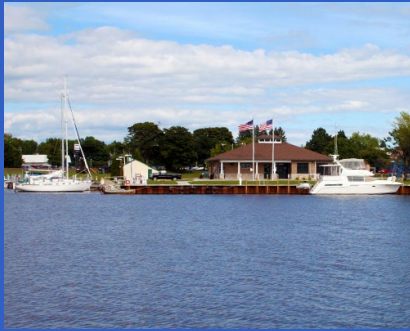
Fourth of July Parade & Fireworks in Manistique