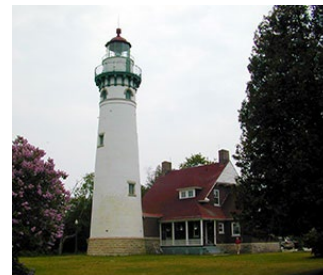
SEUL CHOIX POINT LIGHT and MANISTIQUE EAST BREAKWATER LIGHT