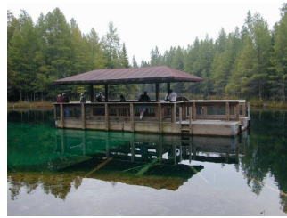
PALMS BOOK STATE PARK (KITCH-ITI-KIPI)