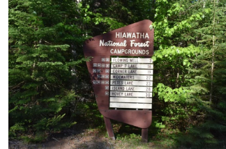
THE HIAWATHA NATIONAL FOREST