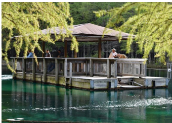
Things to do