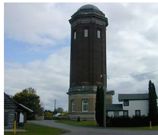
HISTORIC MANISTIQUE WATER TOWER and THOMPSON HISTORICAL SITE