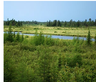
RAINEY WILDLIFE AREA