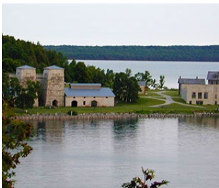
FAYETTE STATE PARK & HISTORIC TOWNSITE and BISHOP BARAGA SHRINE