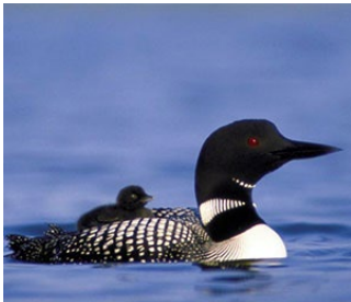
SENEY NATIONAL WILDLIFE REFUGE