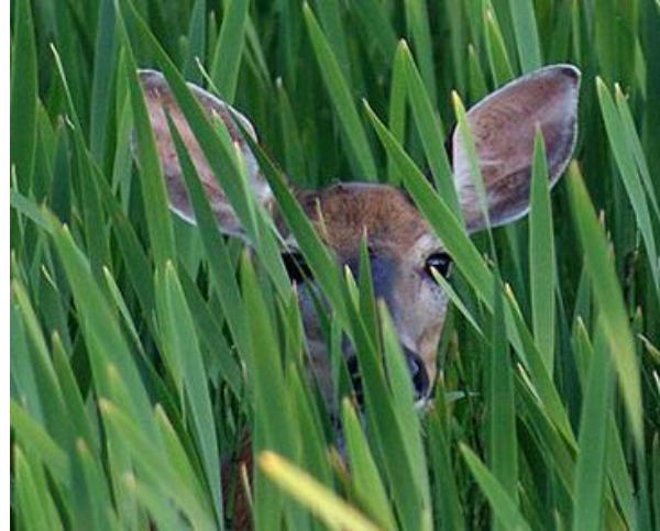
Seney Wildlife Refuge

Visitor Center: Open May 15th - October 20th | 9am - 5pm Daily