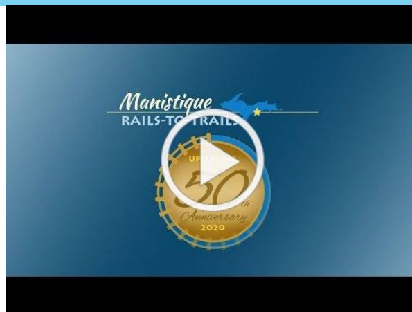
Rails to Trails 50th Anniversary Events - Manistique, MI

SNOWMOBILE EVENT • EQUINE EVENT • BICYCLE EVENT • ATV / ORV EVENT Feb 29, 2020 June 6, 2020 Aug 22, 2020 Oct 3, 2020