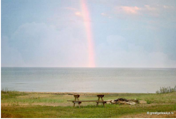
Lake Michigan Shoreline

There is so much to see and do along the shoreline of Lake Michigan in and around Manistique.